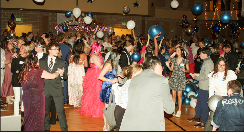
The 92 guests of the 2024 Night to Shine enjoyed dancing amid a balloon drop in their honor