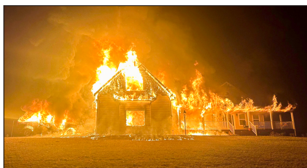
This is the sight that greeted firefighters as they pulled up to a house fire in the north end of the county Feb. 8.

Of course, things could have turned out much differently for the homeowner had Station 13 not arrived so much earlier than the next closest help, which would See Station 13 Response, Page 6A