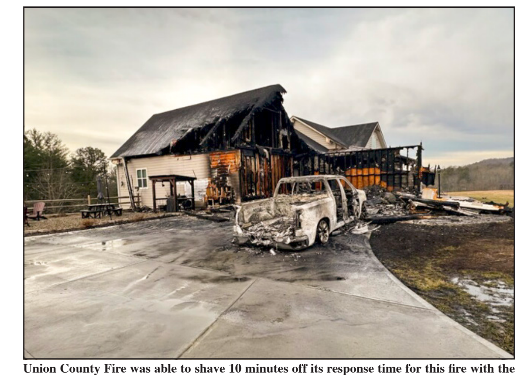
recent opening of Station 13. In the firefighting world, that's a lifetime.

occurred before the new station opened last fall.